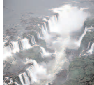
Iguazu Falls - there are a lot more cataracts where these come from.

13. On the day after your arrival we'll introduce you to the city where the tango was born and continues to be a romantic obsession. Our tour will take you to: THE PLAZA DE MAYO (May Square) DISTRICT where, surrounding the square itself, we'll show you the Casa Rosada, roughly the equivalent of the White House in Washington; the 18th-century Cabildo (the Town Hall), built under Spanish rule and the site where, in 1810, Argentine citizens voted to end that rule; the 19th-century Metropolitan Cathedral, with its memorial dedicated to the victims of the Holocaust; the Palace of the Congress, which looks very much like the U.S. Congress building; and more; THE EL CENTRO DISTRICT where we'll point out the Plaza San Martin, with its impressive statue of General San Martin on horseback and the equally impressive architecture of the posh homes in the neighborhood; the towering landmark Obelisk, where crowds frequently gather to hear open air concerts or to celebrate soccer victories; the Teatro Colon, one of the world's technically-finest, most beautiful, and most renowned opera houses (into which we'll take you, if ongoing renovations permit at the time of your visit; if not, we'll take you instead to visit another magnificent opera house, the 150-year-old Municipal Theater in Santiago, during your stay in that city). THE LA BOCA DISTRICT, a colorful neighborhood heavily-populated during the last century by hard-working Italian immigrants, now home to the