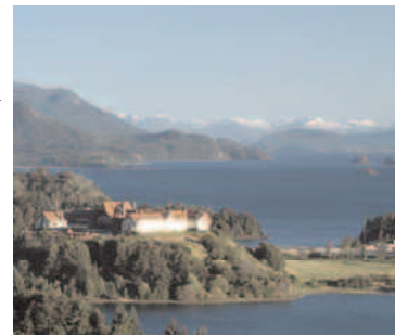
No wonder why people rave about the scenery in Bariloche.

22. On your third day in Santiago we’ll take you north to visit Valparaiso, the colorful port city built into dozens of hills, with wonderful views of the Bay. During a panoramic city tour we’ll point out the Plaza Sotomayor, leading to the port; the Museum of Fine Arts, which resembles some of Antoni Gaudi’s architecture in Barcelona; the impressive mansion housing the Naval and Maritime Museum; the current National Congress Building, with its two towers—one to hold the Senate, the other the House of Representatives. And La Sebastiana, the spectacular house of Chile’s great poet, Pablo Neruda (which you’ll visit). From Valparaiso we’ll