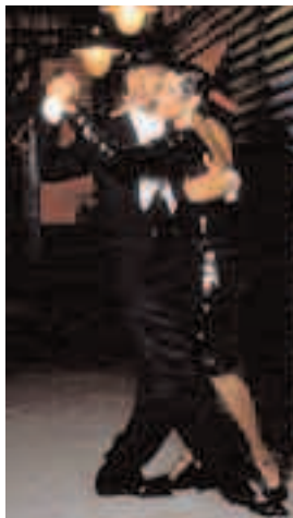
Tango—You’ll see a performance of this most romantic of dances.