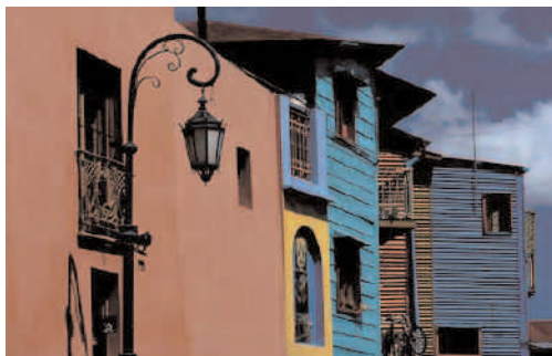
“La Boca District”, Buenos Aires, where we’ll take you to an open air museum and art market.

14. On another day of your stay we’ll take you to visit two of the city’s outstanding museums—the Museum of Fine Arts, with its massive collection of world-class masterpieces; and the Museum of Decorative Arts, where the building’s architecture is just as much a work of art as the collections it houses. And, we’ll take you to THE ONCE DISTRICT, at one time home to most of the city’s Jewish population and still the center of Jewish communal activity. Here we’ll point out the Libertad Synagogue, the AMIA Jewish