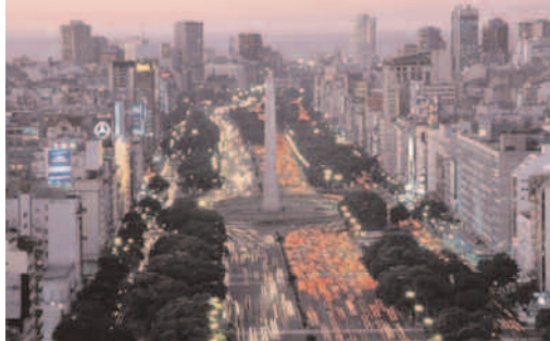
In Buenos Aires—the widest avenue in the world.

Community Center, and Hillel House; then we’ll take you to THE SAN TELMO DISTRICT where the architecture reflects the heritage of Italian, French, and Spanish citizens, and, where, on Sundays, at the Plaza Dorrego a truly fabulous antiques market takes place while couples are dancing the tango in the streets.