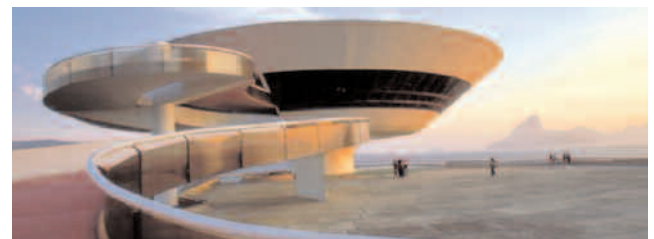
This "flying saucer" is Rio's Modern Art Museum.