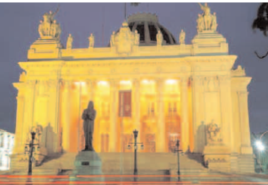
Rio's Teatro Municipal resembles the Opera Garnier in Paris.

5. A 3-night stay in Rio de Janeiro, a city of extraordinary natural beauty, set between the mountains and the sea, with its 50-plus miles of beaches filled with white sand and sun-bronzed people. Here, in the