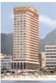
Left: The Caesar Park Hotel at Ipanema Beach in Rio. Right: The elegant roof-top pool at the Caesar Park, Rio.