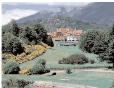
Left: The breathtaking setting of the renowned Llao Llao lodge-resort in Bariloche. Right: The welcoming lobby and piano bar at Llao Llao.